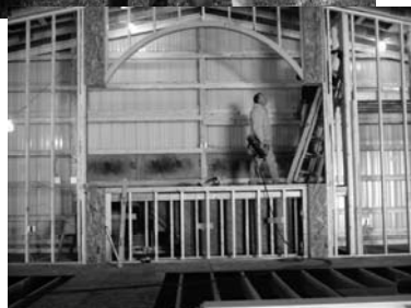
New Home at Last