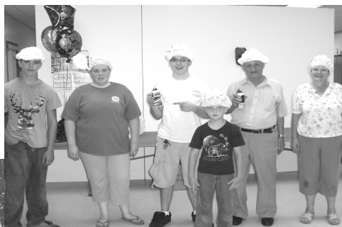
Cheeseball Fury Contestants