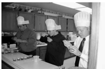
Chili Cook Off Judges