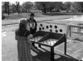
Fun and Games Time