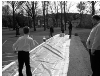
Caleb Turkey Bowling