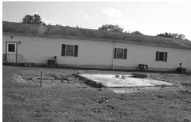
Down with the old...

Prayer Night The first Friday Night of Every Month 7-9pm